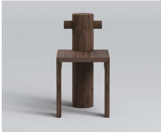
12 PERENNE COLLECTION 05 Thomas Maoisan

The raw and sophisticated Perenne Collection designed exclusively for Studiotwentyseven echoes the tension between lines, curves and angles. The unity of material gives this range of furniture a minimalist and robust appearance. Each structure is singular and monolithic and tends towards a timeless and ascetic design.