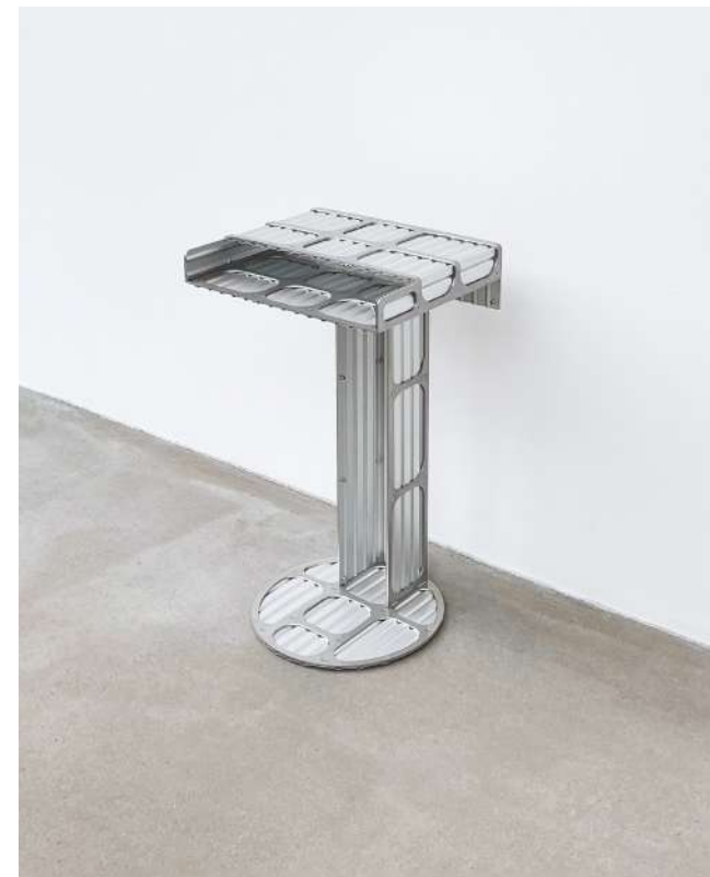
10 TRAY TABLE