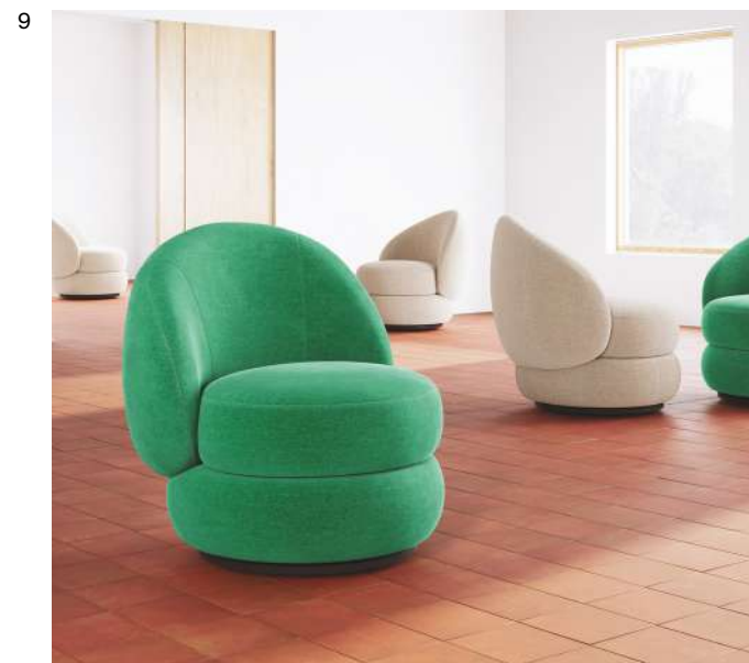
8 ROTONDA BLUE