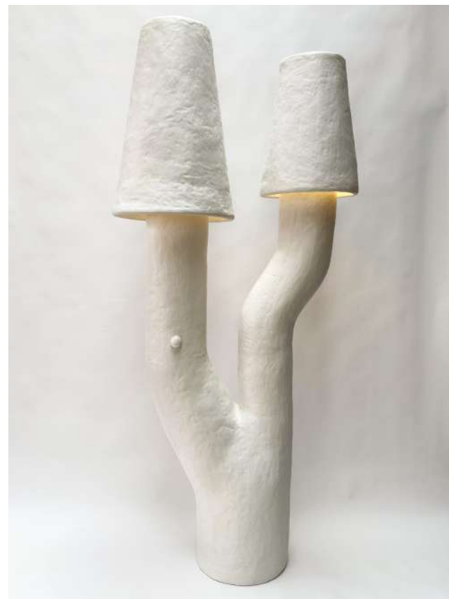
18 KOLLEN LOUNGE CHAIR Tobias Berg

Bent aluminium sheets come together to create this futuristic-looking lounge chair. The silvery-white metal's clean and sharp lines, combined with the soft seating in bouclé wool by Kvadrat/Innvik, make for a simple and modern piece of furniture, designed to survive for generations. The chair is collapsible and easily transportable.