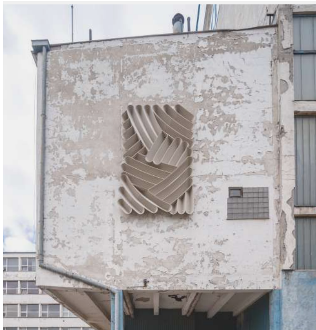
7 COMB & GLYPH