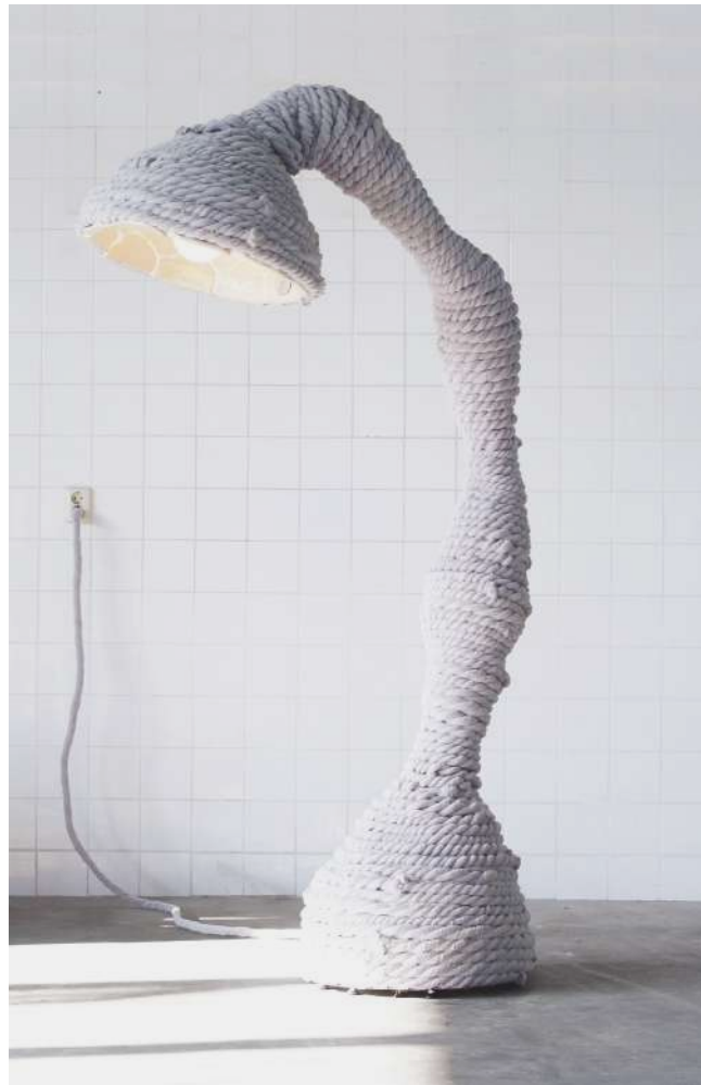
16 POLYPHONY & LALALAMP LAVENDER LARGE

In a world of mass production, where strict requirements dictate the forms of objects, Barry Llewellyn liberates materials by allowing them to morph, crack and melt. The outcome manifests in a series of illuminated wall pieces that embrace a more organic form language and reflect the rhythm of the natural world. From puckering glass and unruly ceramics to overflowing metal, the elements compose unique organisms, each playing with light in their own way. In a time when our domestic environment is dominated by straight edges, standardisation and efficiency, 'Polyphony' presents a refreshing harmony with a daring dance between hard and soft, synthetic and natural.