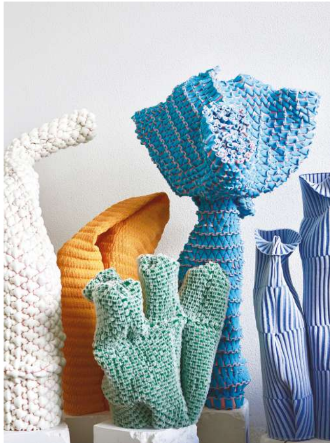
17 KNITTED LIGHT

Knitted Light is a coral reef knitting project based on combining yarns that respond to light in different ways. Created in collaboration with the Textiel Museum in Tilburg, the designer used a thread called a monofilament that has reflective properties and produces new textures when combined with light and mixed with other yarns. When the monofilaments meet flexible elastic yarns, the material appears to contract and expand giving rise to various 3D-type knitting experiments. The play of light and 3D shapes are aesthetically inspired by the beautiful mystical atmosphere produced by coral reefs glowing deep in the sea. In daylight, the piece works as a sculpture that features natural colours, patterns, and textures. When exposed to artificial light the textile changes. Once the light is removed the textile glows, producing its own coral reef effect and creating patterns and shapes on surrounding walls and surfaces. Today coral reefs are losing their colour and glowing less than ever due to the rising temperature of seawater. Knitted Light not only presents the phenomenal beauty of light through an object composed of textile materials but also inspires new reflections on the beauty of nature.